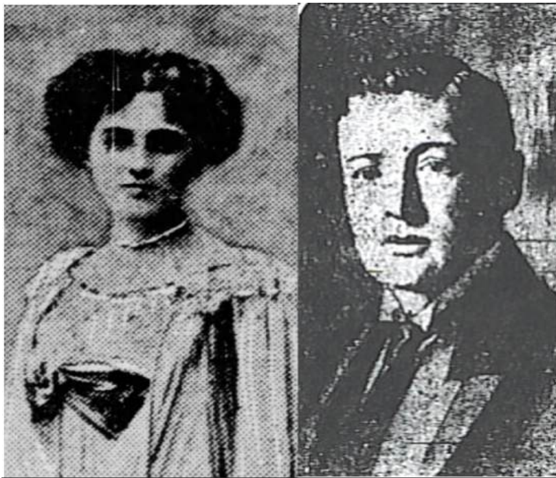
Pamela Plowden's portrait appeared on page 7 of The Philadelphia Inquirer April 4, 1902 above headline BRITISH BEAUTY MARRIES AN EARL. Winston Churchill's portrait appeared on page 21 of The Boston Globe December 18, 1900 announcing his lecture visit.

Black Tie and Decorations (or Black/Navy Business Attire) $150 per person, all inclusive RSVP by November 27