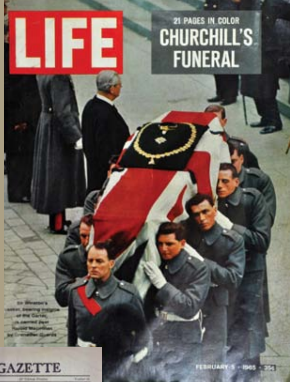
Churchill's funeral on the cover of Life magazine February 5, 1965.

Few people cast as long and complex a shadow across the history of the 20th century as Sir Winston Leonard Spencer Churchill (1874–1965). The son of a British aristocrat and an American socialite, Churchill began his career as an officer in the British army, where his written reports on military conflicts were met with great acclaim. He rose to political and military prominence during the First World War and in this era solidified his reputation as an uncompromising firebrand and brusque, impassioned orator.