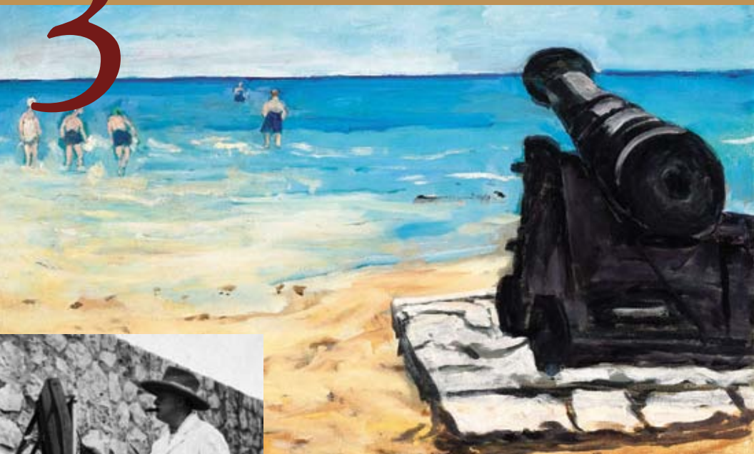
Winston Churchill's 1938 oil painting, Beach at Walmer.