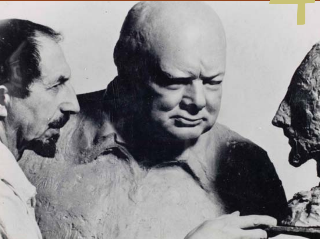
Oscar Nemon with His Portrait of Churchill and Churchill's Portrait of Him