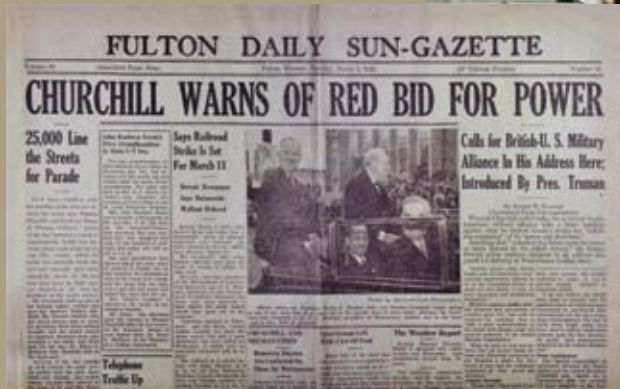
Fulton (Missouri) Daily Sun-Gazette, March 5, 1946, after the famous "Iron Curtain" speech.

Minister in 1940 and deftly guided his nation through the bloodiest of the war years, inspiring troops and citizens alike through his eloquent speeches that were rebroadcast throughout the world.