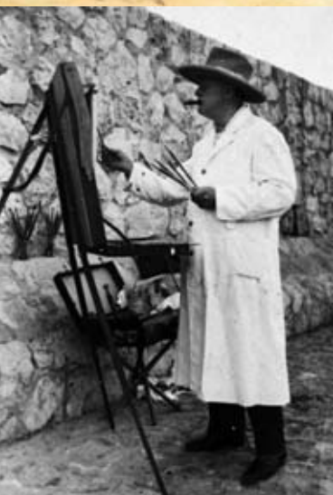
Winston Churchill Painting at D'Urville

Winston Churchill began painting in 1915 at Hoe Farm in Surrey, England, soon after serving as the First Lord of the Admiralty (Secretary of the Navy) during World War I. It was a difficult time for Churchill, who had recently witnessed the catastrophic failure of a naval campaign he had designed for the Dardanelles. He retreated to his newfound hobby and discovered a passion that would remain with him for the rest of his life.