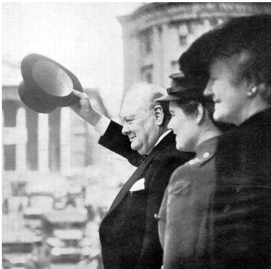
8 May 1945 (later known as VE Day)