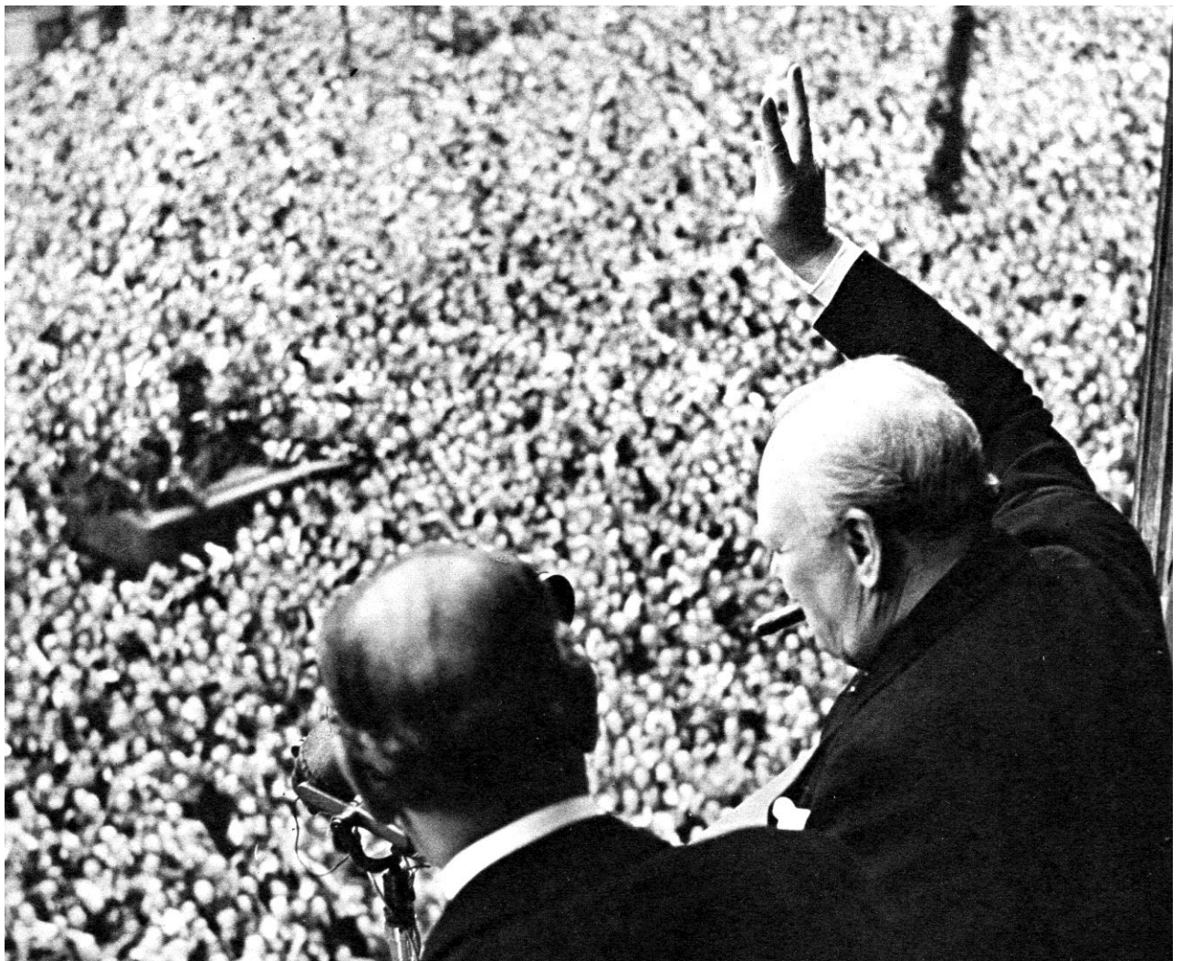
On the balcony of the Ministry of Health building, May 8, 1945

From the balcony of the Ministry of Health building in Whitehall, on May 8, 1945: