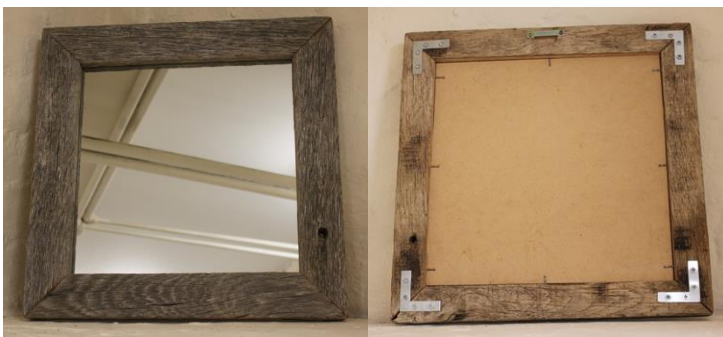
LARGE MIRROR (left)

Each item is unique, and bears the marks you would expect from a weathered trellis. These features only add to the charm of the piece and make for a truly one-off product